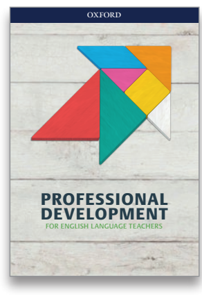
Professional Development Online Catalogue